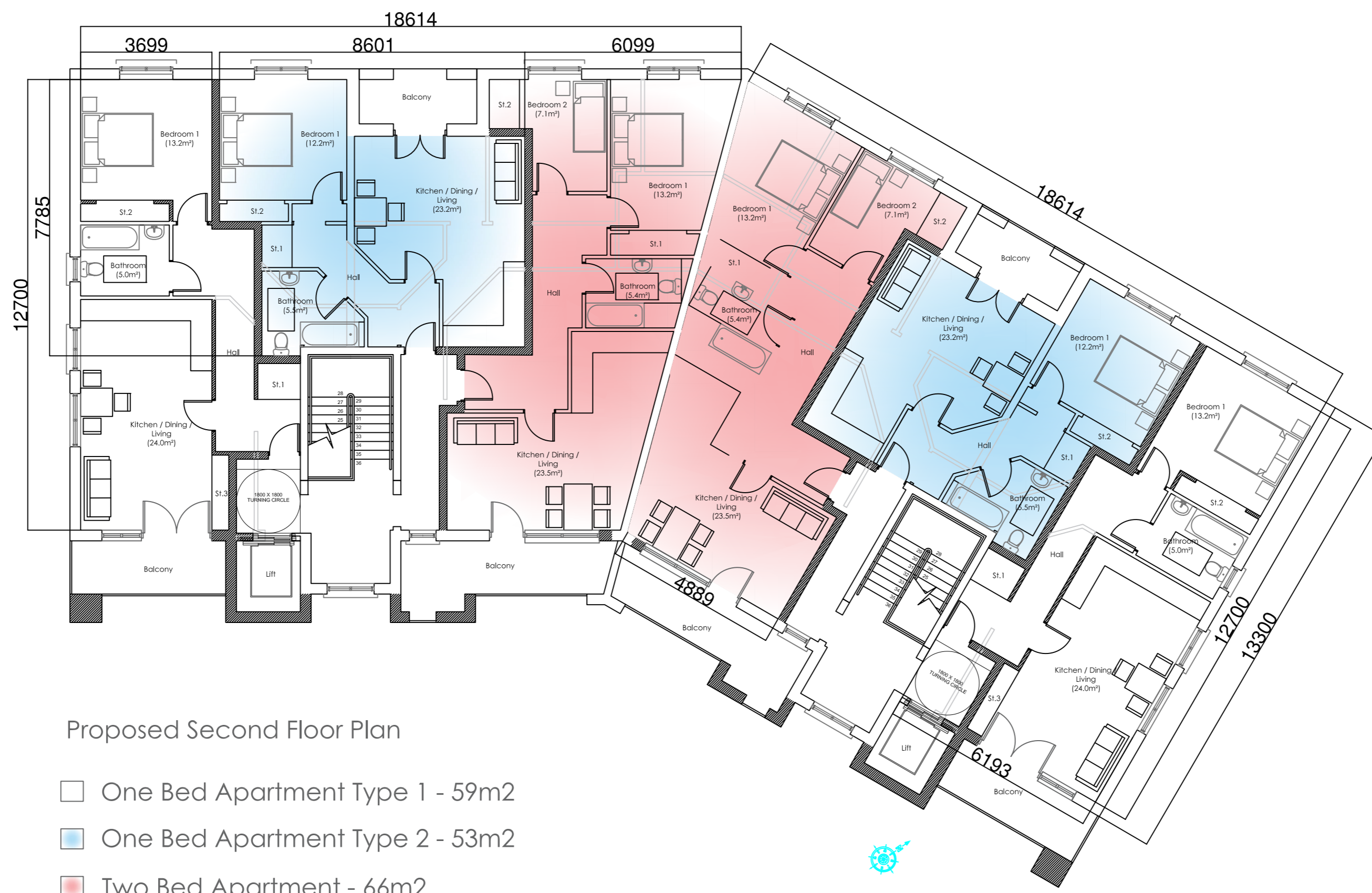
Proposed Second Floor Plan